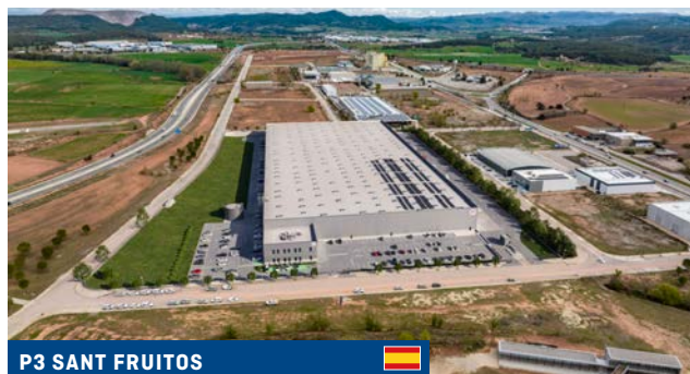
P3 SANT FRUITÓS

Located in Reus, Tarragona, P3 Reus is a unique logistics hub in Spain's Mediterranean Corridor. Situated 5 km from Reus Airport and 10 km from Tarragona Port, the park offers direct connections to major highways, making it an ideal regional, national, and Southern Europe distribution center for blue-chip tenants.