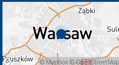
P3 Logistic Parks Sp. Z o.o. ul. Złota 59, Skylight Building, 15th Floor 00-120 Warsaw, Poland poland@p3parks.com