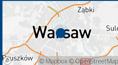
P3 Logistic Parks Sp. z o.o. ul. Złota 59, Skylight Building, 15th Floor 00-120 Warsaw, Poland poland@p3parks.com