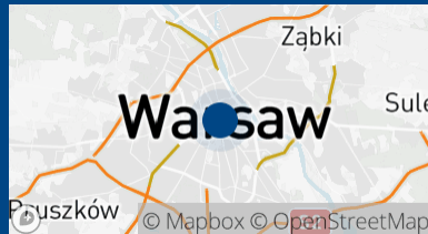
P3 Logistic Parks Sp. Z o.o. ul. Złota 59, Skylight Building, 15th Floor 00-120 Warsaw, Poland poland@p3parks.com