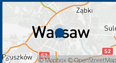
P3 Logistic Parks Sp. Z o.o. ul. Złota 59, Skylight Building, 15th Floor 00-120 Warsaw, Poland poland@p3parks.com