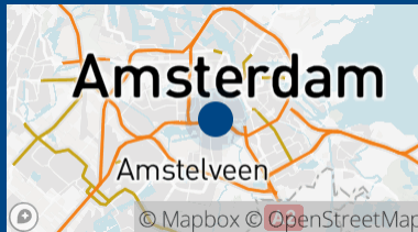
P3 Logistic Parks B.V. WTC Tower I West wing 3rd level, Strawinskylaan 1811 1077 XX Amsterdam, The Netherlands netherlands@p3parks.com