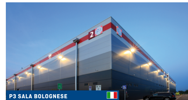
P3 SALA BOLOGNESE

The project is located in the municipality of Castel Gabbiano, in the province of Cremona, within the productive heart of northern Italy and adjacent to the Milan metropolitan area. It enjoys direct access to the A35 (BreBeMi) motorway via the “Romano di Lombardia” tollbooth and is conveniently connected to the Rivoltana Sp 14 and the Sp 185, some of the major routes linking key industrial and commercial hubs to Milan.