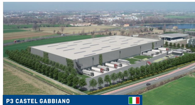
P3 CASTEL GABBIANO

The project is in Interporto Livorno, Collesalveti, east of Livorno, with direct access to the Fi-Pi-Li freeway (Florence–Pisa–Livorno) and 4 minutes from the A12 Highway (Genova–Rome) via the Collesalveti tollbooth. A road and rail link to the Port of Livorno is under construction. The site is 8 minutes from Livorno, 16 from Pisa, and 45 from Florence.