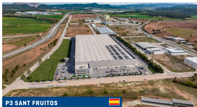
P3 SANT FRUITÓS

Located in Reus, Tarragona, P3 Reus is a unique logistics hub in Spain's Mediterranean Corridor. Situated 5 km from Reus Airport and 10 km from Tarragona Port, the park offers direct connections to major highways, making it an ideal regional, national, and Southern Europe distribution center for blue-chip tenants.